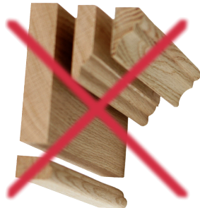
Typical multiple patterns