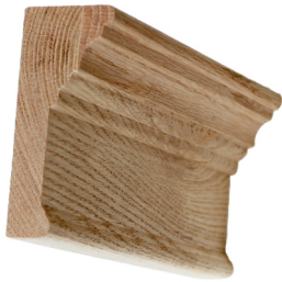
NEWOOD's one piece Architrave