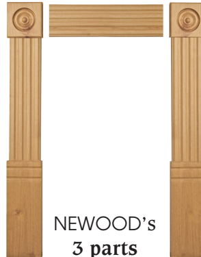
NEWOOD's 3 parts